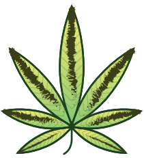
Early Stage of Phosphorus Deficiency