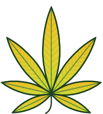
Early Stage of Sulfur Deficiency