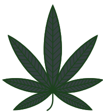
Early Stage of Nitrogen Deficiency