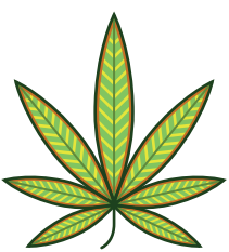
Early Stage of Magnesium Deficiency