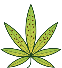
Early Stage of Manganese Deficiency